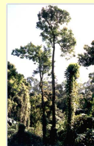
An open area in a tropical forest of vine-covered trees.