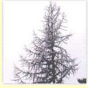
Larch tree in winter.