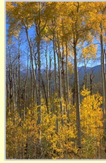
Aspens are some of the only broad-leaved trees found in boreal forests.