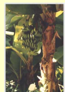
Top: The rainforest canopy often reaches heights of 150 feet (45 meters), and in some places is much higher, blocking most of the sunlight from reaching the forest floor. Left and Right: Torch ginger and bananas are lower growing, understory species.